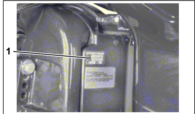
1. Model and serial number

Outboard model and serial numbers are located on the swivel bracket and on the powerhead.